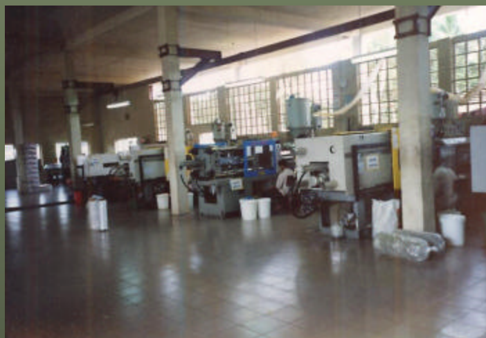
Improved House Keeping Practices